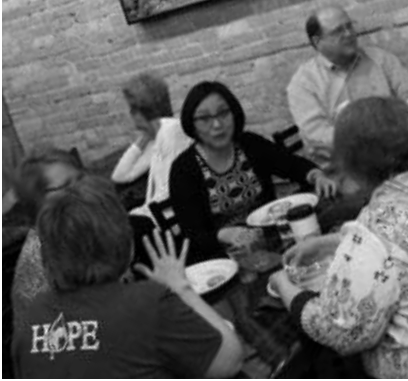
While in Appleton for presentations about A Long Walk to Water, author Linda Sue Park spent time with AEF board and Club 365 members during a social gathering at Copper Rock Coffee Company.

A grant from the Alan and Vira Stoner Education Fund supported the attendance of more than 100 AASD middle and high school students at WE Day Chicago. WE Day presents a full day of inspirational speakers and performers and is designed to help young people find their passion and then act to improve their community and world.