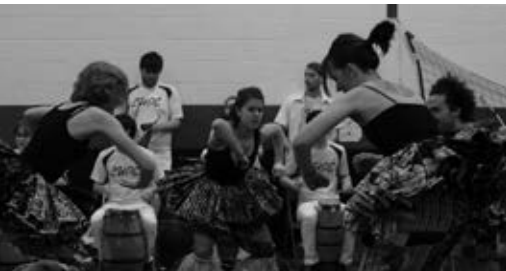
The Lawrence University Percussion Ensemble visited Houdini Elementary School to demonstrate music and dance unique to other cultures.

AEF funding helped implement the Recess Buddies program. Students in fifth and sixth grades put leadership skills into practice as they modeled positive social play and helped teach games to students in Kindergarten through fourth grades.