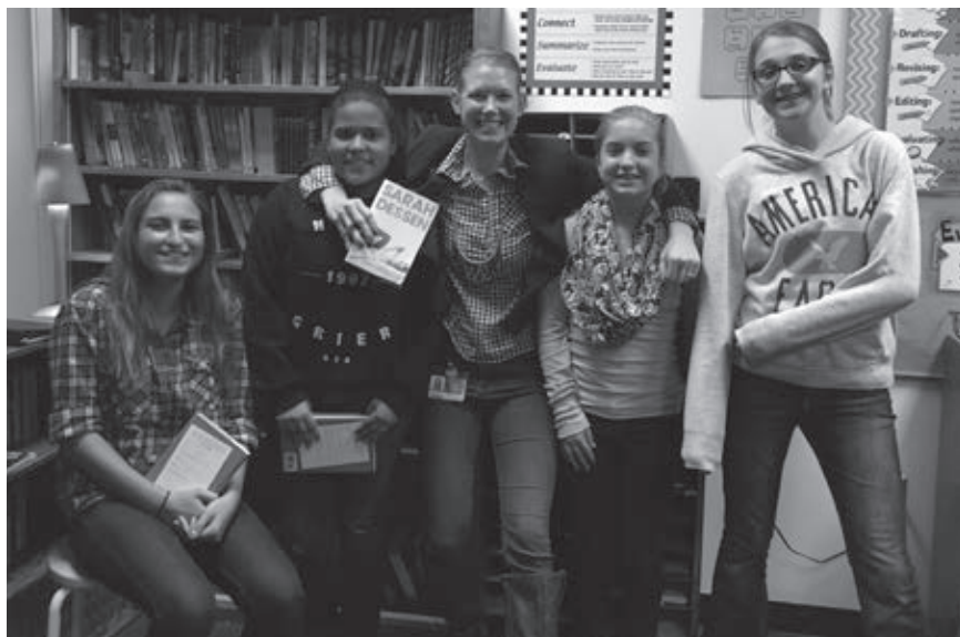
Students and teachers met during the summer to discuss books they were reading and to enjoy time together.

“These results would not have been possible without funding from AEF,” Didreckson said. “Bottom-line is we couldn't have done it.”