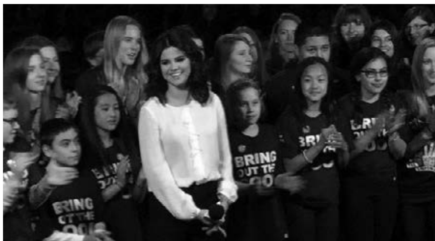
More than 100 AASD middle and high school students attended WE Day in Chicago. Celebrities including Selena Gomez participated in the event designed to encourage young people to make a difference.